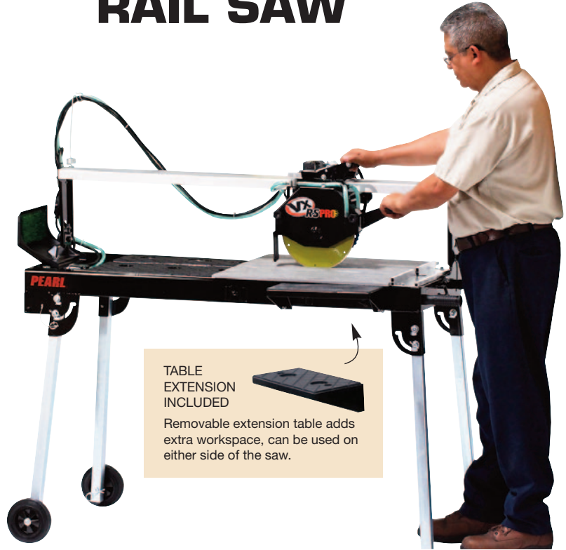
TABLE EXTENSION INCLUDED

Removable extension table adds extra workspace, can be used on either side of the saw.